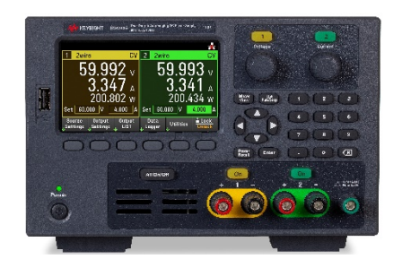
E36234A 400W Dual Output Autoranging power supply 60V, 10A