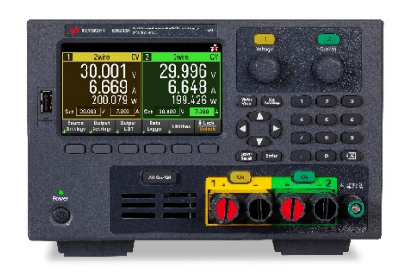
E36233A 400W Dual Output Autoranging power supply 30V, 20A