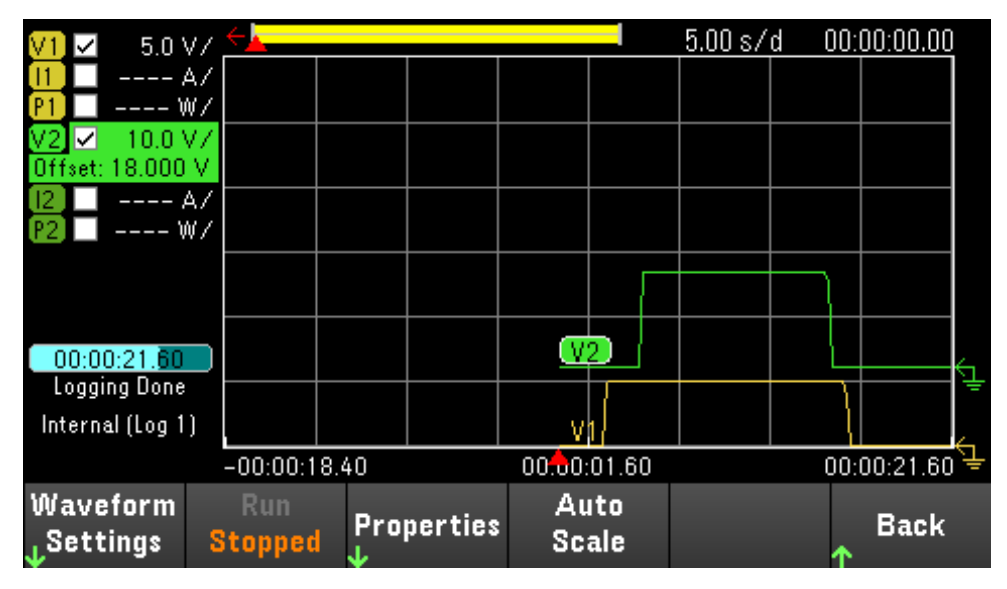
Figure 7. View and log data on multiple traces to the internal memory or external USB drive in the data logger view

You can easily create data logging measurements over a specific time frame. The E36200 Series simultaneously logs data on all DC outputs, both voltage and current measurements, spaced by a programmable sample period, to the large color display and a file. Export the data logger display in PNG and BMP file formats or export the time-stamped data as a .CSV file for reports and documentation. The built-in memory allows logging data without a USB drive.