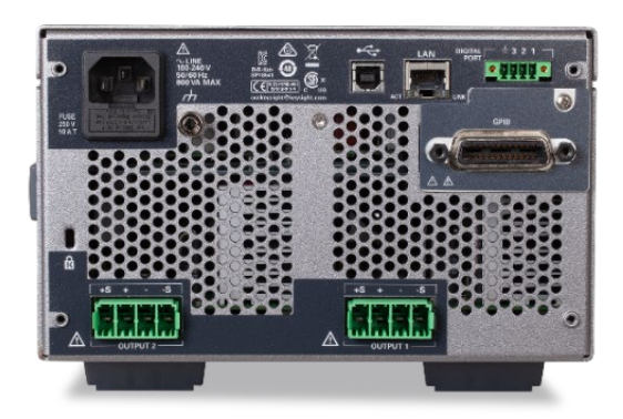
Figure 5. Rear output terminals for easy wiring for both bench and system setup

All models support operation via, SCPI (standard commands for programmable instruments) programming language, IVI (interchangeable virtual instruments) driver, web browser, or BenchVue. The E36200 Series ships standard with LAN and USB. GPIB is also an available option.