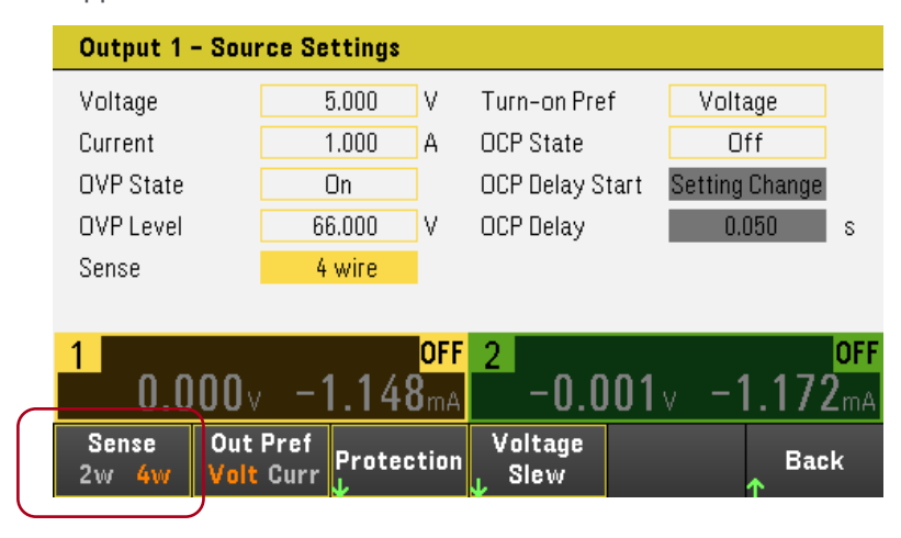
Figure 2. E36200 set 2-wire or 4-wire sensing for output 1 in just one click

To further improve the voltage regulation and measurement accuracy of the DC outputs, the E36200 Series offers you a 4-wire remote sensing capability along with the convenience or 2-wire local sensing on all outputs. Remote sensing requires the addition of a second set of leads to monitor the voltage at the test device. It is particularly useful for compensating for the voltage drops in the power leads when using the higher output currents. Internal relays ease switching between 2-wire local sensing and 4-wire remote sensing thus eliminating the need for shorting bars or jumpers commonly found on other bench power supplies.