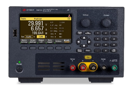
E36231A 200W Autoranging power supply 30V, 20A