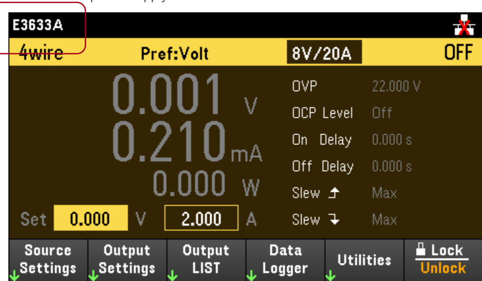
Figure 6. Enable E3633A/E3634A mode on the E36231A and E36232A

The E36231A and E36232A are code compatible with the E3633A and E3634A to assist in migration to a more modern power supply.