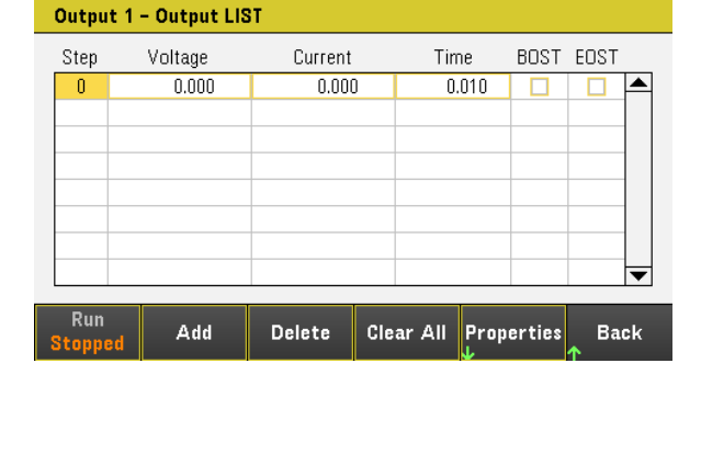
Figure 8. Output sequencing and output LIST mode, with slew rate setting