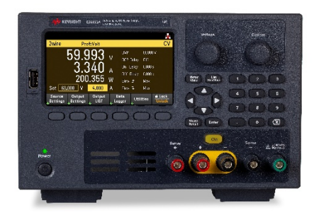
E36232A 200W Autoranging power supply 60V, 10A