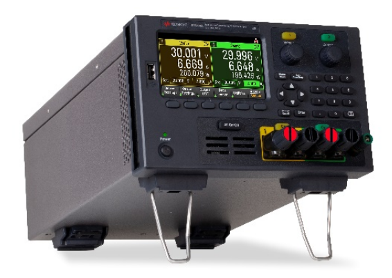
Figure 4. E36233A high current binding post